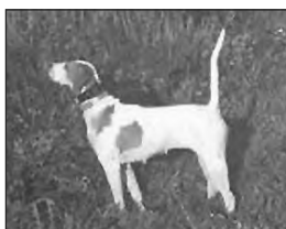
Casey Creek Crystal Ice | 2022 Champion