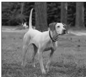
MILLER'S HEAT WAVE Winner, 2022 Region 2 (AFTCA) Amateur Shooting Dog Championship

Member AFTCA & EPFTA • Blank Ammo & Manufactured Barrel Guns Only!