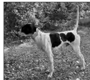
R Q'S SADDLE Winner, 2022 Keystone Open Shooting Dog Classic

Grounds: Property of Keystone Bird Dog Trust, Petersburg, PA. Directions: From Rt. 22, 6 miles west of Huntingdon, take Rt. 305E (right) to Petersburg. One mile north of Petersburg, turn left toward Camp Blue Diamond, go 1/2 mile, cross bridge and immediately turn right to trial grounds. GPS address: 6728 Bethel Rd., Alexandria, PA. Drawing: Tuesday, October 17, 6:00 P.M., at the home of the field trial chairman. Dinner: Region 2 will sponsor a steak dinner Saturday evening, followed by the Region 2 meeting.