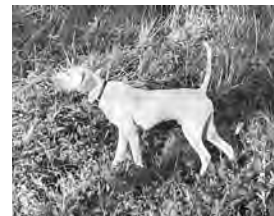
Lester's Storm Chaser 2022 Champion

POINTS AWARDED TOWARD THE PURINA TOP DOG AWARD & PURINA HANDLER OF THE YEAR AWARD A NATIONAL CHAMPIONSHIP QUALIFIER