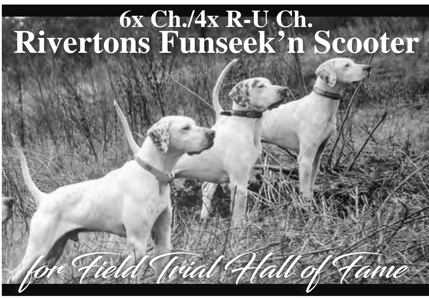
Rivertons Funseek'n Scooter with his sons, Just Irresistible and Funseek'n Hit Man