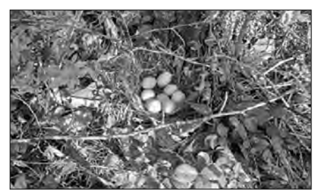
Grouse Nest five feet from trail course.

It must be something in the planets because Bob wasn't the only one with a puppy. Everyone seemed to have little a