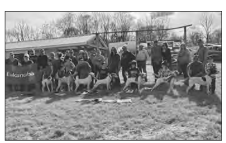
Youth Stake Participants

The Youth stake had the biggest gallery,