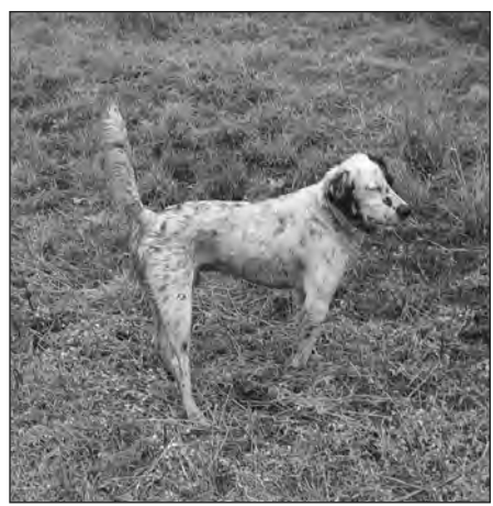
Long Gone DeQuan, Second in the Granite State Open Shooting Dog Classic; First in the Phillips Brook Amateur Shooting Dog Classic