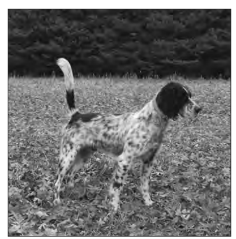
Moss Meadow Seeker Open and Amateur Shooting Dog Winner