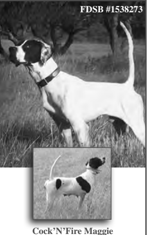
Cock'N'Fire Maggie — Direct daughter of Jet — 2017 National OSD Champion