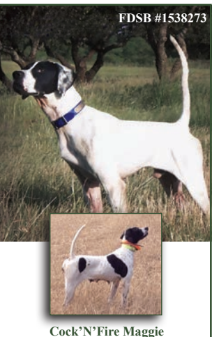
Cock'N'Fire Maggie — Direct daughter of Jet — 2017 National OSD Champion