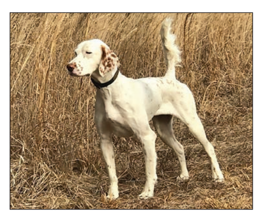
I'm A Southern Natural, Runner-Up in the Region 3 Amateur All-Age Championship

The main topic of conversation at Hoffman always seems to be about the birds. There are few peers in public field trial venues when the birds are abundant. Unfortunately, birds are seldom what one would refer to as abundant. Most often, the word adequate is more descriptive; this year was no exception. An extremely dry late summer and early fall had the early-release birds under stress from the get-go. Those that had survived until mid-December were strong and healthy