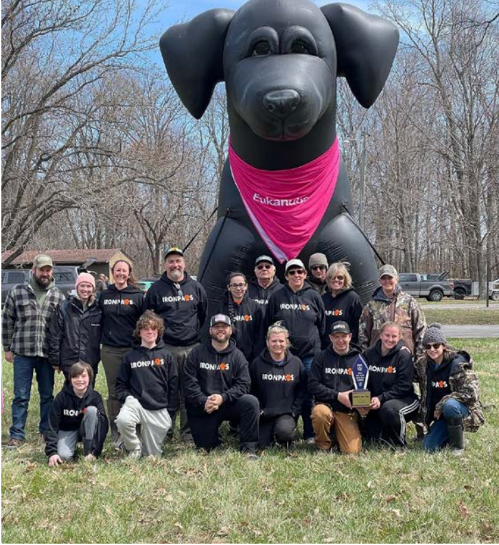
Great Lakes Antler Dogs – Club of The Year.