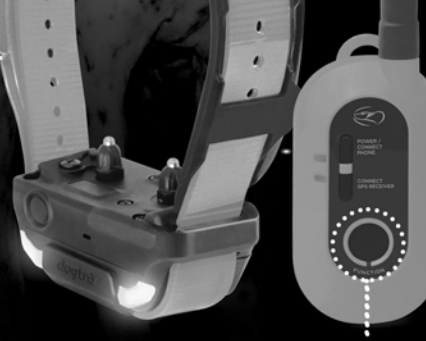
E-COLLAR FUCTION BUTTON