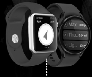
QUICK ACCESS SMART WATCH