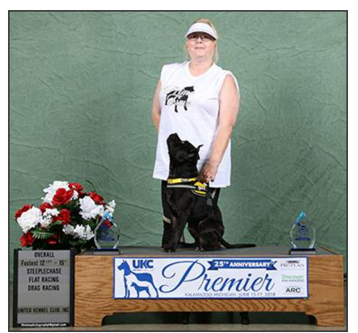
Fastest Category D 12.5"-15"

CA NV NI PTS URO1 UWPCH CH Fonvielle's Ptak4t Of Hopyards.