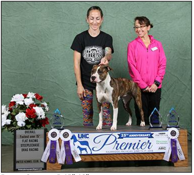
Fastest Category D 15"-18"

CA NV NI PTS URO1 UWPCH CH Fonvielle's Ptak4t Of Hopyards.