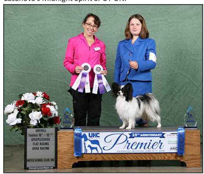
Fastest Category D 10"-12.5" USA UFA GRCH Casabellas Grt Expectations SPOT-ON.