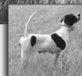
Cock'N'Fire Maggie — Direct daughter of Jet — 2017 National OSD Champion