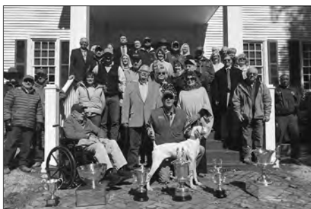
Miller's Speed Dial 2020 National Champion