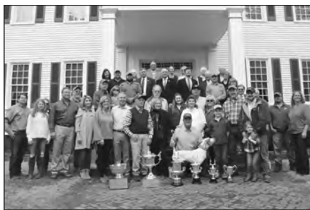
Lester's Sunny Hill Jo 2017 & 2018 National Champion