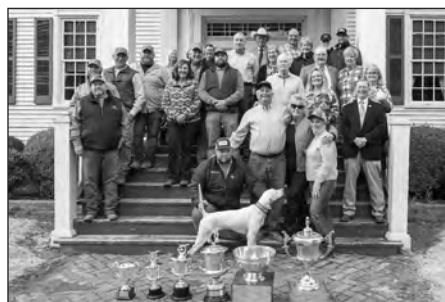
Lester's Shockwave 2022 National Champion