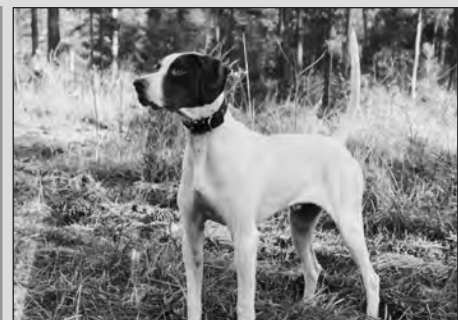
Ch. Dominator’s Rebel Heir