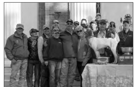
Lester's Storm Surge 2023 Continental Open Champion