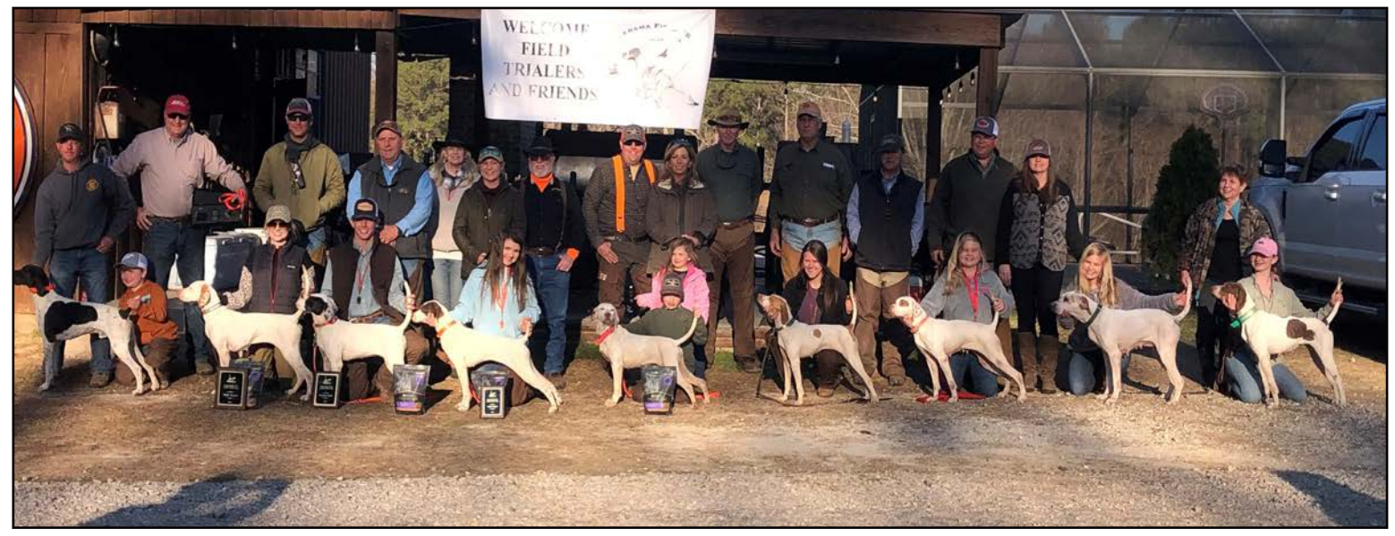
All the participants along with parents, grandparents, family members and well-wishers.