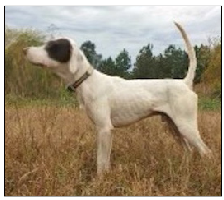
Game Rebel, winner of the Region 8 Amateur All-Age Championship.

The tenth brace consisted of H P Cottonmouth (Shoemaker) and Worsham's Super Sport (Worsham). Cottonmouth was picked up early. Super Sport finished the hour but was unable to locate any birds.