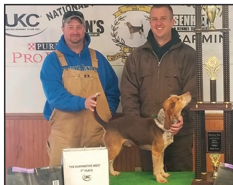
CHAMPION | WRLDCH TNT's 3MC Chief |