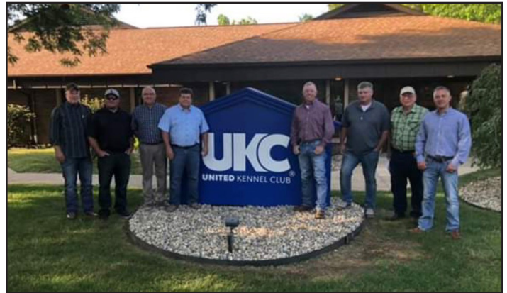
The Beagle Gundog Alliance during a visit to the United Kennel Club office, prior to UKC’s rebranding, August 2019.