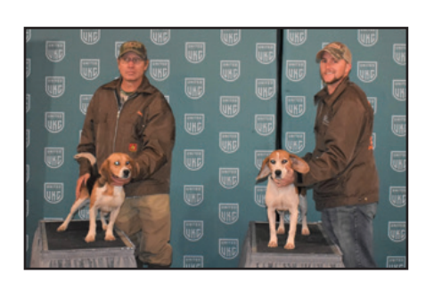
National Chase All-Age Cast 4