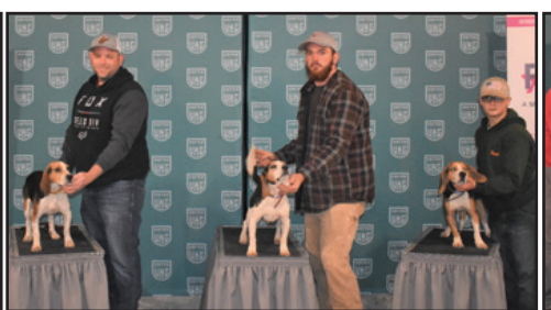
National Chase All-Age Cast 2