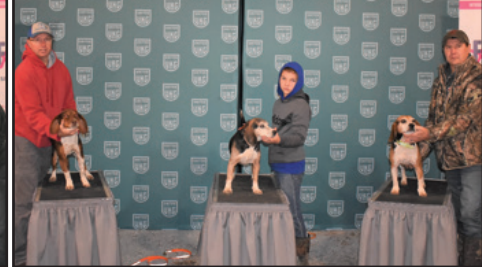
National Chase All-Age Cast 3