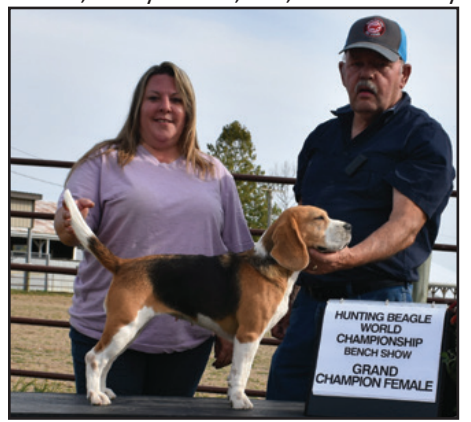
Grand Champion Female: WSHOWCHX2 HBCH NGRC GRCH Burke's Treasure of Diamond's, F, Owner: Ottie Burke, WV,