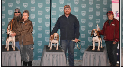
National Chase All-Age Cast 1

The Overall All-Age Winner received $1,000, a trophy, a certificate for a Winners Jacket from UKC, and a Dog Box from Evans Dog Boxes.