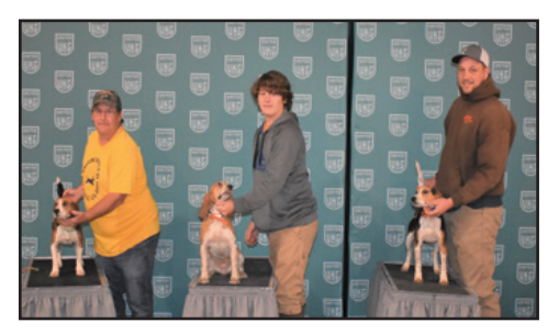
National Chase Junior Cast 3