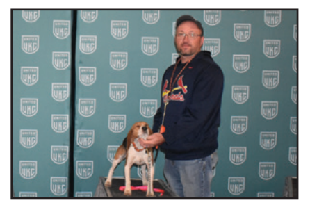
National Chase Junior Cast 2

The Overall Junior Winner received $500, a trohpy, a certificate for a Winners Jacket from UKC, and a Dog Box from Evans Dog Boxes.