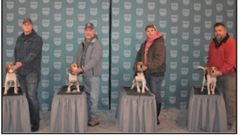
National Chase Junior Cast 4