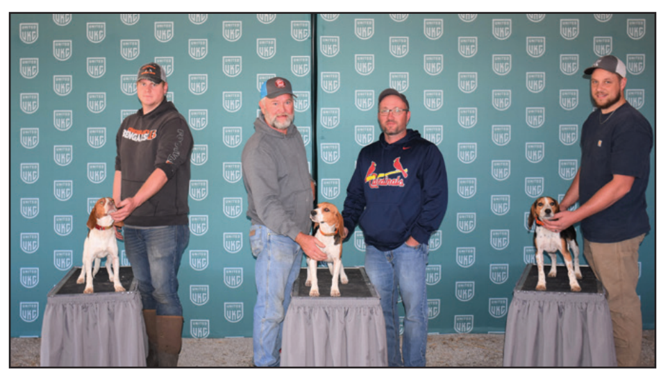
National Chase Junior Final Cast.